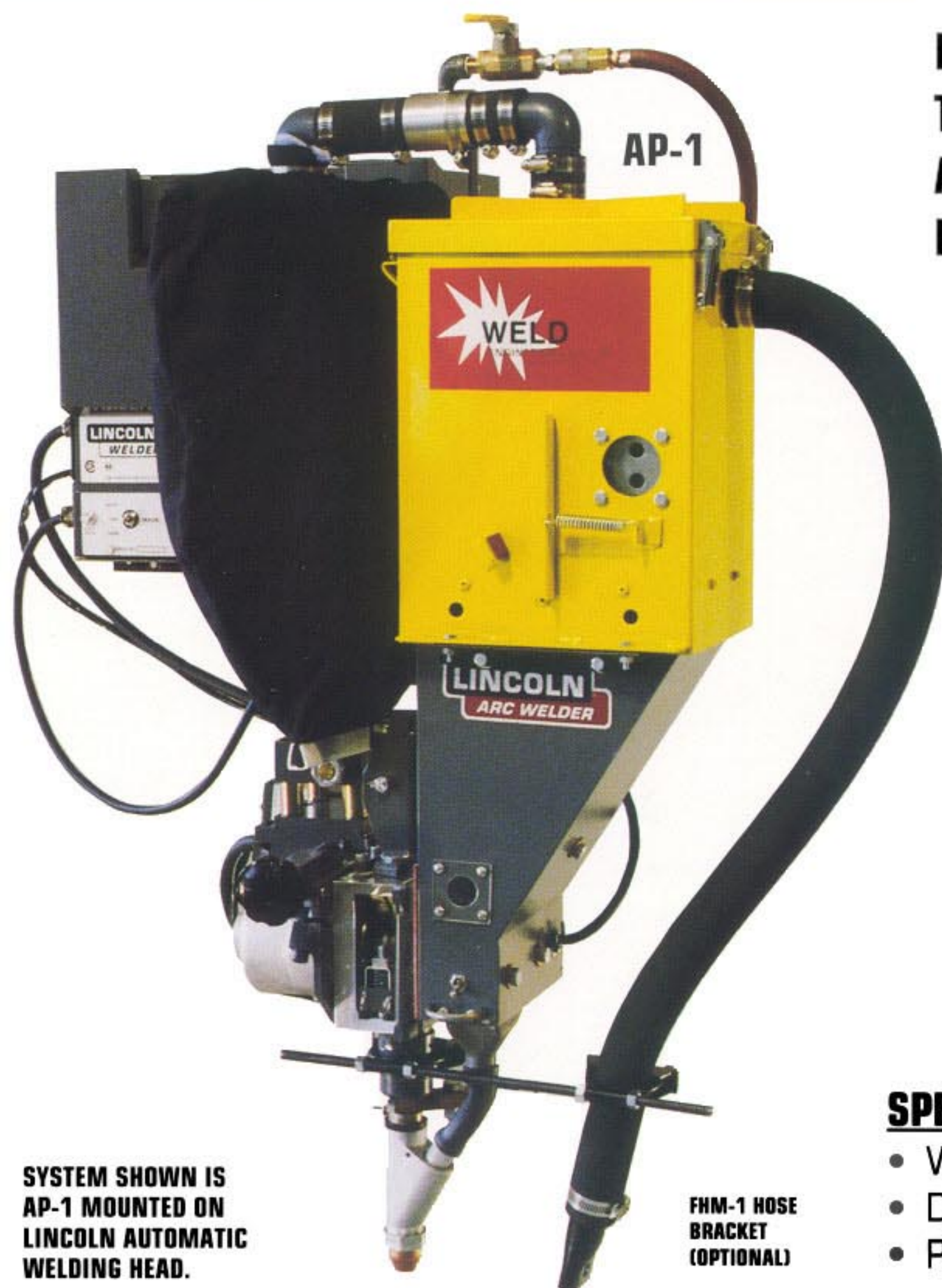
SYSTEM SHOWN IS AP-1 MOUNTED ON LINCOLN AUTOMATIC WELDING HEAD.